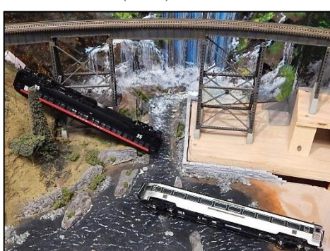
That's a long way down

Observation fell off 50-foot the high trestle, crashing into the rapids below with а mighty SPLASH! A wreck crew (and a morgue team) was dispatched and picked up the