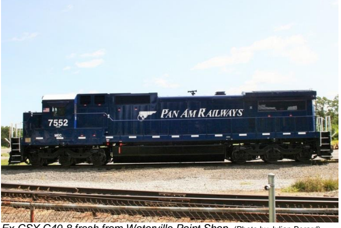
Ex-CSX C40-8 fresh from Waterville Paint Shop.

RAILPACE REPORTS that Pan Am Railways has decided to rid itself of all its EMD units and become an all GE railroad. They are to acquire 15-20 B40-8s and an additional 20 C40-8s.