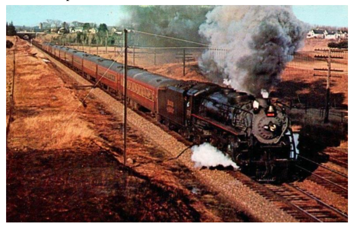
Patriot Ledger October 18, 1969

Steamtown. The B&M brought the loco down to the Billerica Shops, where it was cosmetically-restored to the design and colors it had when originally delivered. A total of 84 gallons of paint was used! Then the B&M transported 3713 to Hoosac Pier #3 by rail, then it was carried by barge through the Charles River Basin locks by the Perini Corporation to the Museum, where it remained until the mid-80s, when it was moved down to the new Steamtown location in Scranton, PA. It continues to undergo complete restoration there in the old DL&W shops.