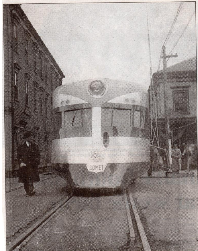
LOST HINGHAM: This Hingham Square scene is from the 1940s. The Comet was a diesel-electric streamliner built in 1935. It held 160 passengers and ran between Boston and Rhode Island. At the start of WWII and because of increased rail travel larger trains were needed on the main lines. The three car Comet was placed on local commuter service on the Boston to South Shore line. In Hingham Square, The Lincoln Building on the left was torn down in 2014, after heavy snow collapsed the roof. The Railroad Station on the right was torn down in 1949. The train tracks are now 20 feet below Hingham Square. The locomotive was scrapped in 1951. However there is a model at the South shore Model Rail Road Club Museum in Bare Cove Park. The photo is from the Hingham historical society and the text is by Geri Duff.