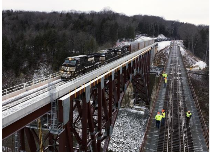
Norfolk Southern C44-9W No. 9345 leads train 36T, a Buffalo, N.Y., to Allentown, Pa., manifest train on a new steel arch span on Dec. 11. The arch replaces an iron truss bridge built by the Erie Railroad in 1875 and shown on the right.

rolled across the new 963-foot steel arch bridge spanning the Genesee River. The $75 million bridae replaces the former Erie Railroad Portageville Bridge, an often-photographed ironand-steel landmark built in 1875. It stands more than 230 feet above the Genesee River in New York's Letchworth State Park. "This is a very exciting day for Norfolk Southern and for the future of freight rail service in New York's Southern Tier region," NS CEO James A. Squires says in a statement. The new span, built 75 feet south of the old truss bridge, allows NS to run industry-standard 286,000-lb. cars over the Southern Tier line, up from the current 273,000-pound limit. Trains can move across the bridge at 30 mph, up from 10 mph on the old span. The line carries about a dozen trains per day and is a key link in Norfolk Southern's route to New England from the west. It also handles some freight bound for Canada and northern New Jersey. (TN)