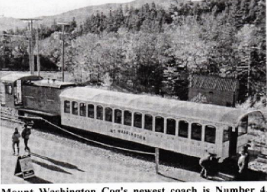
Mount Washington Cog's newest coach is Number 4, painted white; it entered service in early July. On the downhill end is blue biodiesel M6 LaPrade, named for Cog Railway engineer and mechanic Al LaPrade, who designed the railway's automatic hydraulic switches.

biodiesel is M6 LaPrude which entered service this season. It continues the new tradition of every loco in a different color, and is painted white. Also painted white is the newest coach, Number 4, which entered service in late June. While outwardly virtually identical to the other coaches. it's said to be aluminum-framed; improved window framing eliminates the ingress of rain below the sills, helping to preserve the wooden bodysides. Meanwhile, the next biodiesel, to become M7, is now under construction at the Base Station workshops.