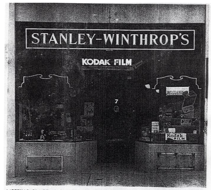
MEETING PLACE of the Quincy Model Railroad Club, operating the "Old Colony Connecting Railroad" at Stanley-Winthrop's, 7 Revere Road, Quincy, has attracted model builders and enthusiasts from all over New England. A complete stock of kits, supplies, and authentic to-scale fittings of the highest quality is carried for the convenience of builders of any kind of models. Stanley-Winthrop's has brought to this locality a craftsman's headquarters of which the South Shore can be justly proud. Now one need not send away and wait for their materials. They get the BEST at once at Stanley-Winthrop's, Quincy, or in Boston at 38 Chauncy St., Suite 814.

The new station is scheduled to be constructed in early 2022 on the east side of the existing railroad tracks. Amtrak is expected to spend 5.4.5 million on the project, and the town will elase and naintain it. The new station is designed to have the first level-boarding platform in Vermont, at 4-feet tall and 345 feet long. The boarding platform so will be heated to melt snow, a feature advocated for by town staff. [Contributed by Richard Lee]