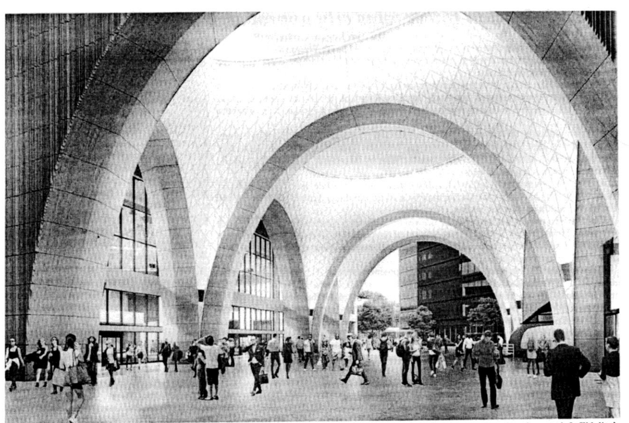
The future train platform closest to Atlantic Avenue, facing east, with the entrance to the station through the sliding glass doors at left. Fidelity's headquarters are in the distance.