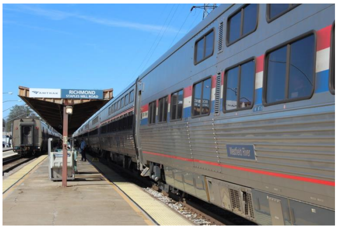
Viewliner II sleeper Westfield River is one of five sleeping cars on the northbound Silver Star as it pauses next to the Carolinian at Richmond, Va., on Feb. 25, 2022. A significant portion of the train's sleeping-car inventory went unsold as pricing did not reflect increased inventory.

Amtrak has since stepped up hiring, but the company won't say whether capacity will be expanded or if sidelined Superliners like Sightseer lounges or transition sleepers will ever return to the Capitol Limited or Texas Eagle . Meanwhile, it is prudent to not overextend the ability to reliably serve passengers if there isn't sufficient equipment and personnel to answer the bell.