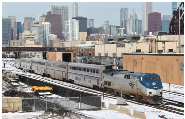
Sidelined equipment has led to smaller trains. The Texas Eagle leaves Chicago on Jan. 4, 2022, with two coaches, one sleeper, a combination diner-café, and a baggage car. Limited capacity pushes prices higher and sellouts curb revenue by turning away prospective passengers.

Corridor service, Amtrak instituted voluntary and forced buyouts for fiscal 2021 to conserve cash.