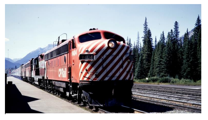
CP's Canadian arriving Banff in May 1970.

short, 150-kilometer (93-mile) link between YYC's currently rail-less terminal, Calgary city center, and Canadian Pacific's (CP) picturesque Banff Station. Calgary is already the focal point for CP's development hydrogen locomotion of and trackside fuel generation. Both the Alberta and Canadian governments are aggressively encouraging hydrogen generation, whether "grey" from natural gas, or "green" from wind and solar. The most compelling argument for train service from Calgary's flatland airport to the peaks of the