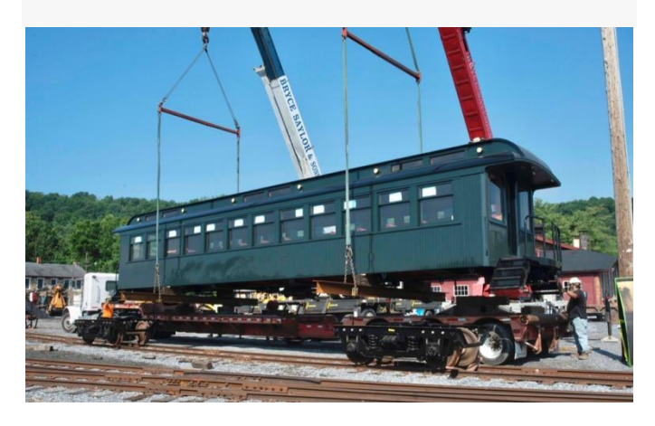
The first of four new East Broad Top passenger cars is lifted off the truck that brought it from its builder in Bellingham, Wash.

Three more cars will soon augment railroad's open-air fleet