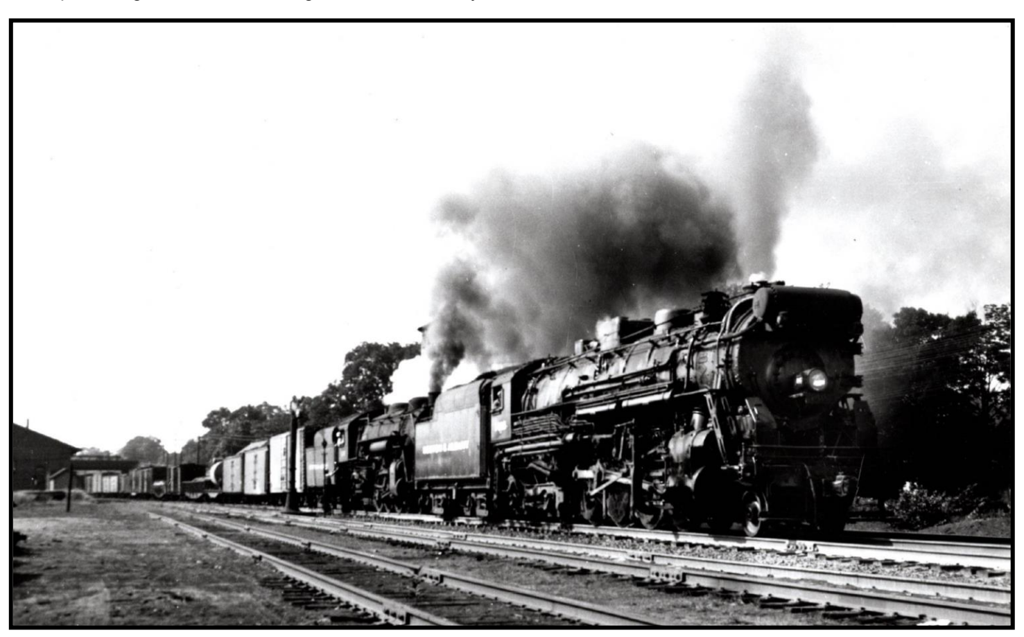
From the archives: B&A double-headed eastbound freight at West Brookfield, Mass. Locos: 2-8-4 #1416 Berkshire-type and 4-6-2 #576 Pacific-type. Stopped for water (tower behind Pacific). Photo by Robert A. Buck 9-7-1947. (Good example of using a freight loco and a passenger loco to power a freight-Ed.)

While some believe the STB is overstepping its bounds and placing an unnecessary burden on the railroads, I disagree. Indeed, the longer it takes for the Class 1s to get their acts together, the more we will hear now distant thunder around the possibility of re-regulation of railroading. Class 1 leadership needs to study the history books on railroading in the 1970s and read about how the Interstate Commerce Commission regulation left the railroads to wither on the vine and some to die on the vine. The rail industry is in a much better position now to meet the needs of all stakeholders and has a bright future ahead if it can get back on track. Otherwise, railroad service will remain in the toilet, and the industry will haul a smaller percentage of the nation's freight than it does today.