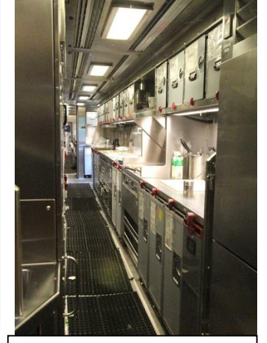
The Viewliner's spacious kitchen, as viewed from the hallway leading to the cafe car.

Before meals in a bowl were introduced, Amtrak dining cars on eastern trains served sleeper and coach passengers with one or two chefs in the kitchen and a lead service attendant, plus one or two servers. This employment level is currently handling coach passengers on a space-available basis on the western trains; with a bit of staffing creativity (maybe with incentives cross-union