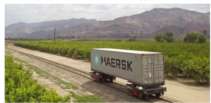
A prototype of the Parallel Systems autonomous container rail system tests in Southern California. Parallel Systems

"GC and HOG believe the development and anticipated adoption of this technology has the