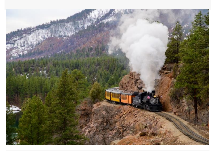
K-36 No. 481, the last coal-fired Durango & Silverton locomotive, handles its final excursion before conversion to oil firing on Saturday, March 23, 2024.

THE FINAL CHAPTER of the long history of coal-powered trains on the Durango & Silverton Narrow Gauge Railroad came Saturday, March 23, with a round-trip excursion between Durango and Cascade, Colo., handled by a Baldwin Class K-36 2-8-2 No. 481. The locomotive will now be converted to oil firing, completing conversion of the roster that began with K-37 No. 493 in 2020. The process was hastened by fire concerns, including settlement of a federal lawsuit stemming from a 2018 wildfire in which the railroad agreed to new operating procedures during periods of elevated fire risk. The railroad has also made increased use of diesel locomotives, including four units purchased from the White Pass & Yukon. (TN)