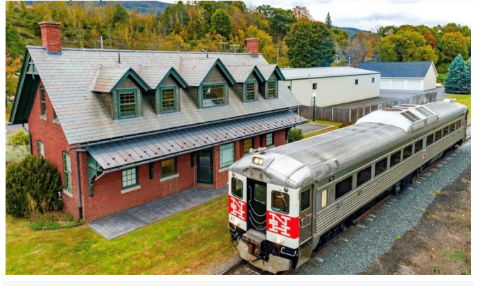
is at the Lenox Station Museum in Lenox, Mass.

THE BERKSHIRE SCENIC RAILWAY Museum ran its first excursions with former New Haven Budd Rail Diesel Car the last weekend of October. No. 41 is one of five RDCs leased by the museum from the Budd RDC Foundation earlier this year and moved to the museum's two sites. No. 41 and RDC-2 No. 1960, built for the Baltimore & Ohio, are at the Hoosac Valley Service in Adams; a three-unit set of the remaining equipment from the Roger Williams, the all-RDC passenger train built for the New Haven,